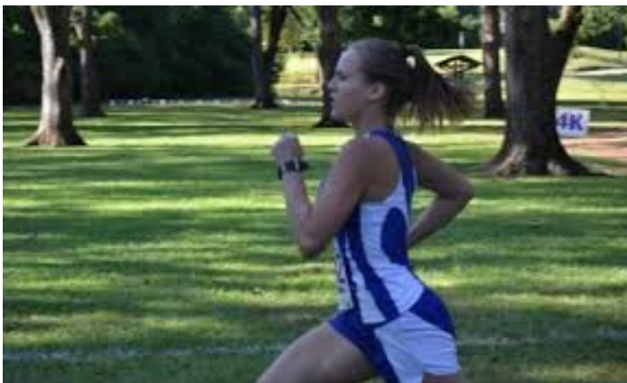
A Central Heights Cross Country runner sets her pace.

The race, hosted by the Fredonia Rotary Club of Nacogdoches, is a flat fast event from The Fredonia Hotel through SFASU campus to the Lanana Creek trail (10k only) and back. Proceeds benefit the Fredonia Foundation Scholarship Fund a local charity of the Fredonia Rotary Club.