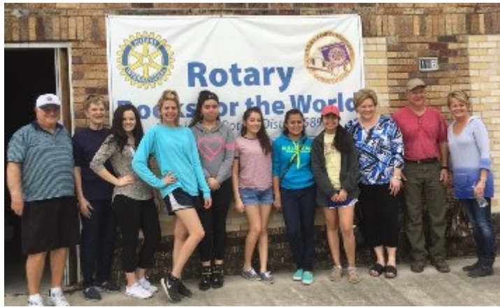
The Dickinson club members worked at the Books for the World warehouse in Pasadena in February with Rotary Club members and Dickinson High School Interact kids.

Rotary Books For The World is an international service project started in 2000 and supported by Houston area Rotary Clubs, Rotaract Clubs, and Interact Clubs. Books for the World is proud to announce the shipment of the 271st 40' shipping container of books (for a total of over 10 million pounds), as well as several containers of school furniture, bicycles, and bicycle parts to Rotarian led literacy projects in 23 different countries.