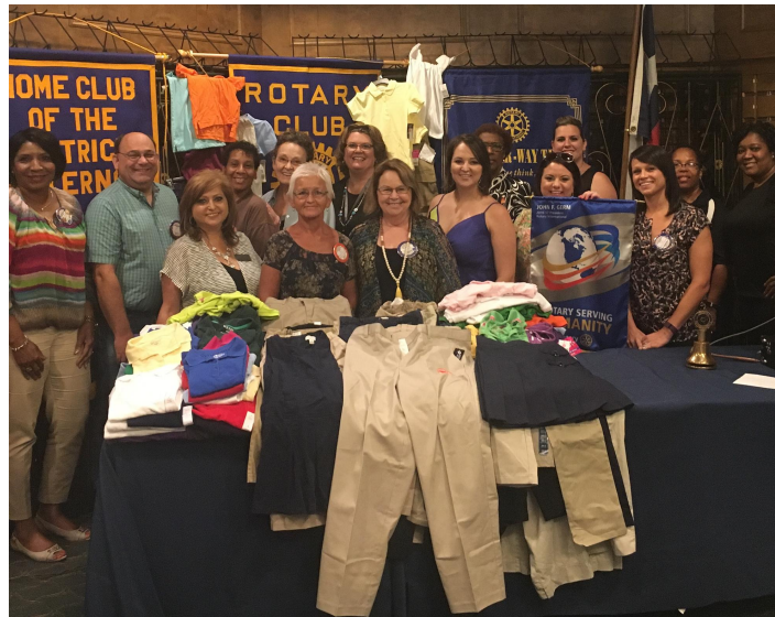
Angelina Rotary Club members collected 215 clothing items for Back to School Bonanza. Items included shirts, pants, skirts and jumpers. Children who attend the Bonanza are given a new uniform to start the school year. Members will work shifts the day of the Bonanza to pass out the uniforms to children and their families. Angelina Rotary, Lufkin Rotary, Lufkin Ladies Lions Club, and the Junior League of Lufkin partnered together to provide the uniforms.