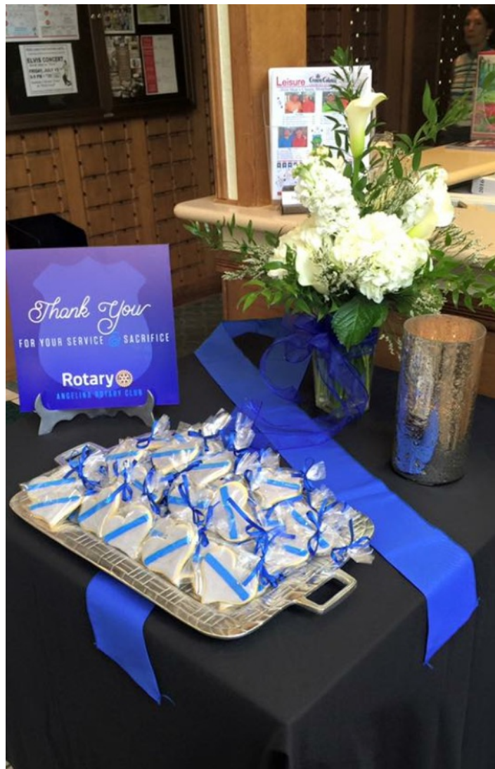
Members treated local peace officers with cookies, thanking them for their service.