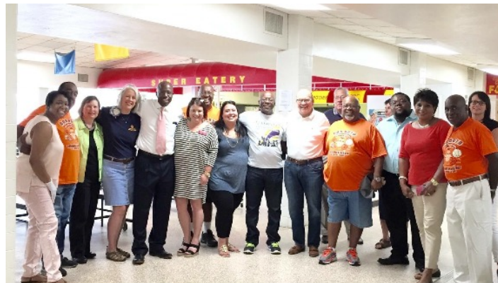
Members partnered with the local chapter of the Concerned Black Men to serve lunch to the parents of the children who attend their summer camp.